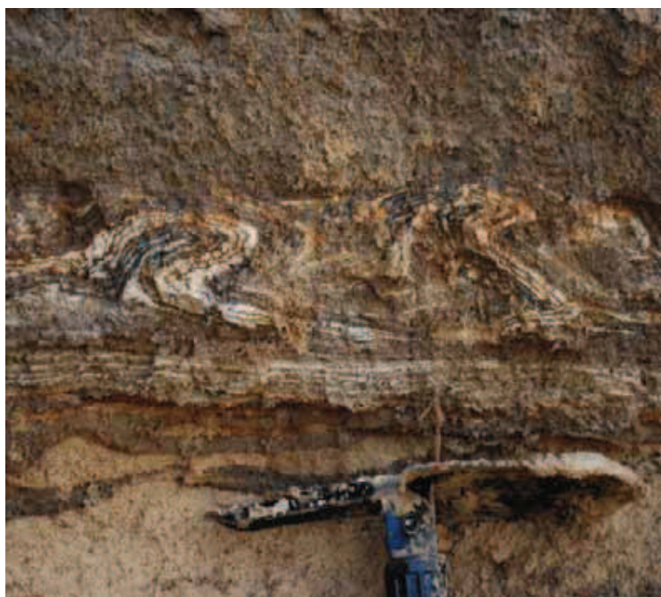
Steven A. Austin

In determining what the eclipse looked like, Waddington took into account other phenomena that physicists have studied related to the appearance of the sun or the moon at sunset. These phenomena are well known and may be observed on any clear evening. The first is that the moon or sun appears somewhat oblate due to the refraction of the earth's atmosphere. The second is that, because there is more atmosphere for the sun's or moon's light to go through at sunset, the shorter blue wavelengths are filtered out, resulting in the familiar red color of either celestial body at this time. In the case of an eclipsed moon, there would be the extra darkness of the earth's shadow on the face of the moon. Further, some of the light reflected back from the moon would